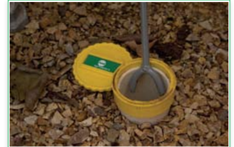
Turn shut-off valve clockwise to shut off water to system. Do not over tighten.