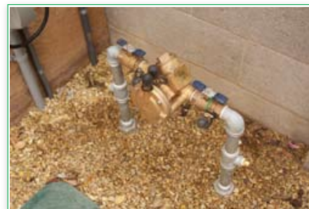
RPA - Reduced Pressure Assembly