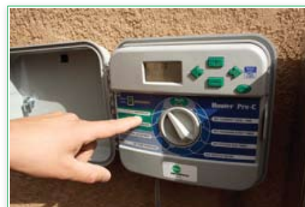
Sprinkler System Control, set to the OFF position.