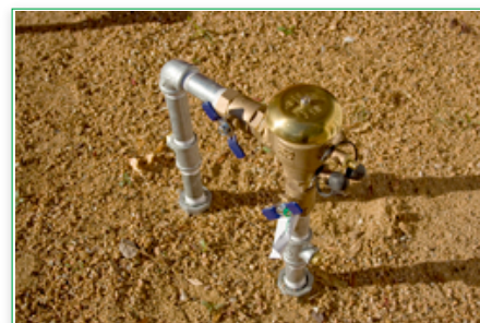
PVB - Pressure Vacuum Assembly