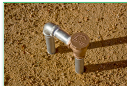
AVB - Atmospheric Vacuum Breaker