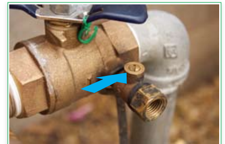
Flat head turnable test valves

Congratulations! You have completed your sprinkler system winterization.